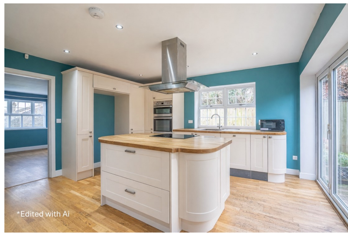
*Edited with AI

To the first floor are three well-proportioned bedrooms. The principal bedroom enjoys a dual aspect and benefits from its own en-suite shower room, fitted with a contemporary three-piece suite. The remaining two bedrooms are served by the stylish house bathroom, which features a freestanding bath alongside modern fittings, creating a luxurious yet practical space.