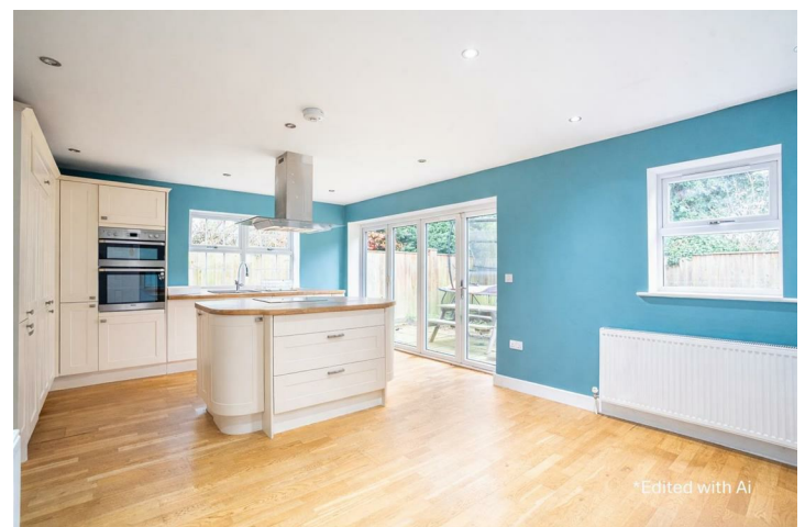
*Edited with AI