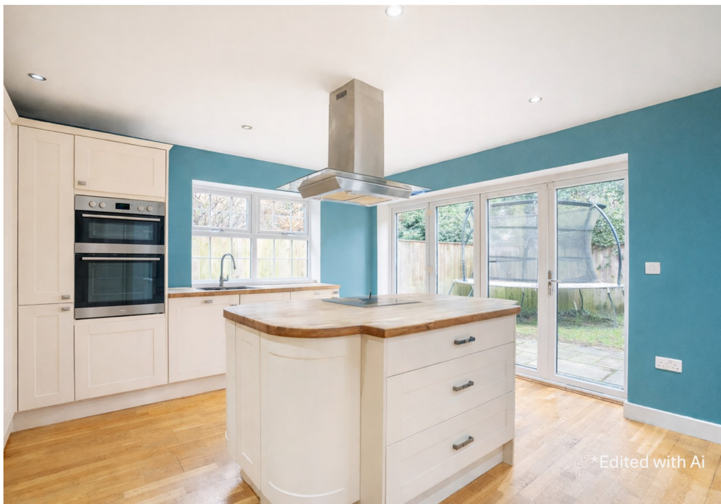
*Edited with AI